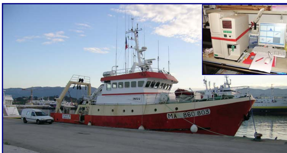
Figure 1: POTES-Mer Cruise – A study of the effects of hydrostatic pressure on marine prokaryotes

Small cells in the aquatic environment require a high sensitivity A40 or A50-MiniFCM to effectively detect them by flow cytometry – other flow cytometers simply do not have the light scatter sensitivity or resolution.